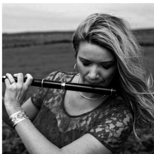
Kirsten Allstaff Flutes & Whistles