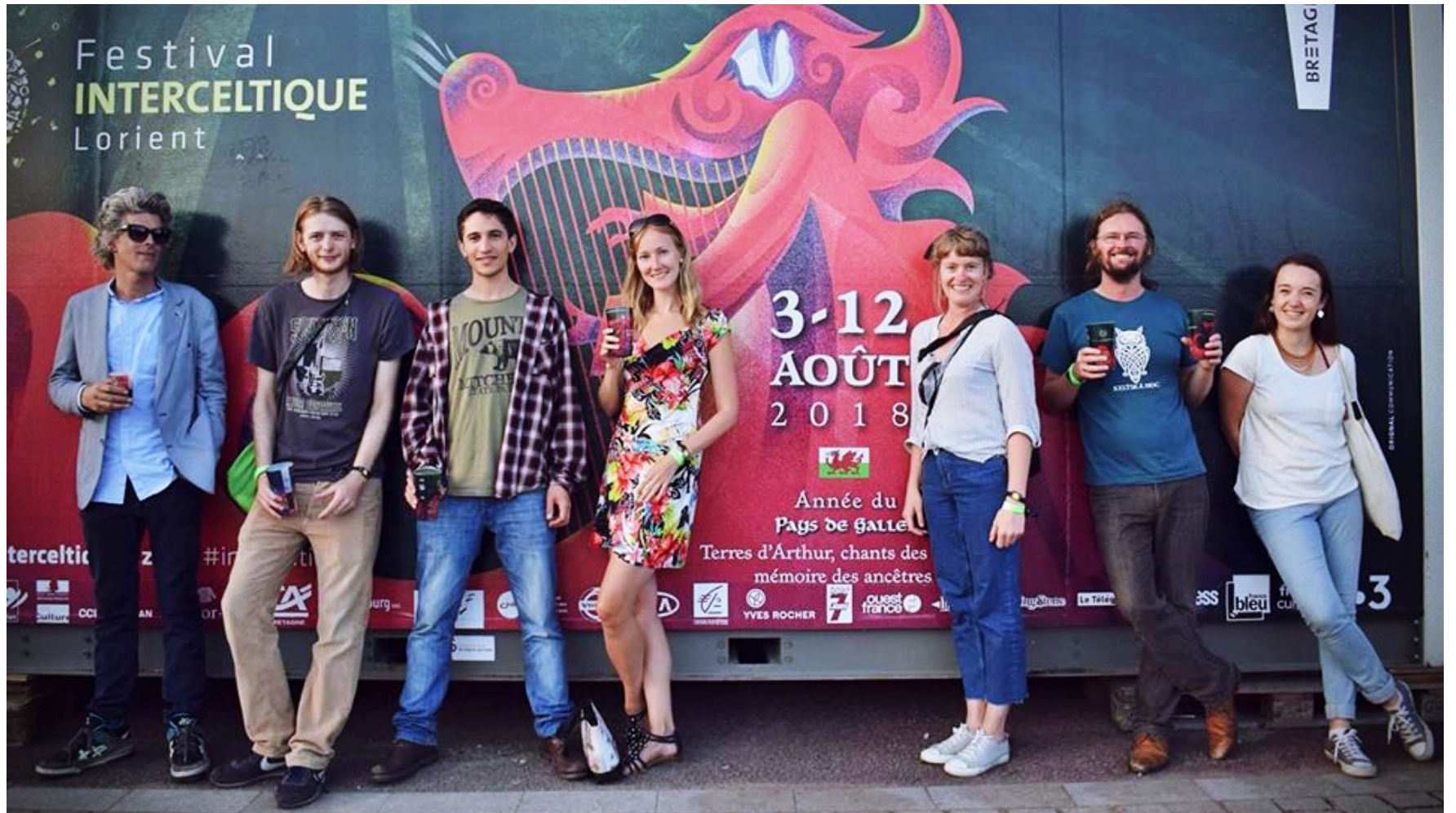
Los Paddys performed at the 48th edition of the Lorient Interceltic Festival 2018.