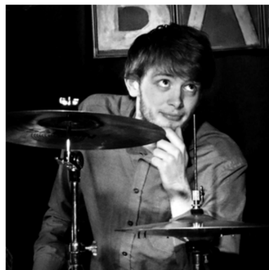
Angelo Heart Drums