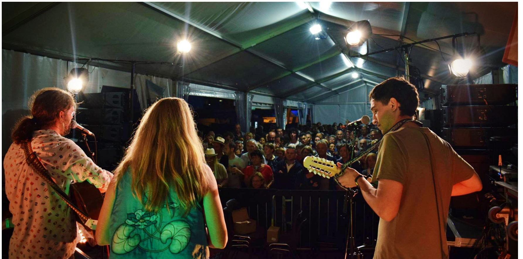
Festival Interceltique de Lorient - Pavillon de l'Irlande